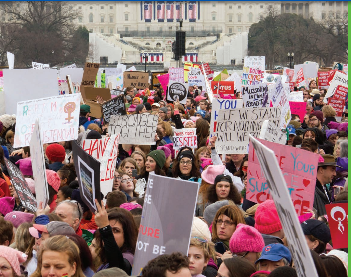
IMAGE 1.1 On January 21, 2017, one day after President Trump was inaugurated as President of the United States, three to five million people across the United States participated in the first annual Women's March. It was one of the largest single-day protests in U.S. history.